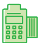
No. of POS Transactions